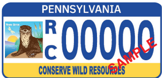
Plate Colors - Blue, white and yellow