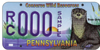
Plate Colors - Blue, yellow, purple and white

(Please Check Type of Plate Requested on Front Side of Form)