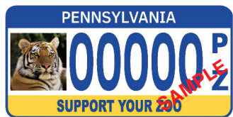
Plate Colors - Blue, white and yellow

You can have your very own registration plate commemorating Pennsylvania's proud railroading heritage. Whether you love trains, appreciate fine art, or like a unique registration plate, you'll want this distinctive PennDOT registration plate that features Grif Teller's famous 1928 painting When the Broadway Meets the Dawn . The painting depicts the Pennsylvania Railroad's Broadway Limited on its Chicago to New York run as the first light of day breaks along the Juniata River in central Pennsylvania. The registration plate reproduces the rich, deep colors of Teller's original work of art, capturing the power and speed of the onrushing locomotive. The Pennsylvania Railroad played a key role in making the commonwealth a leader in the railroading industry. The "Pennsy" story comes alive at the world-class Railroad Museum of Pennsylvania in Strasburg, Lancaster County, and in the collections of the State Archives of Pennsylvania in Harrisburg. Your support will help underwrite the educational and exhibit programs of the Pennsylvania Historical and Museum Commission.