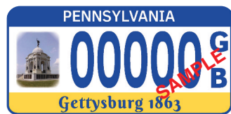
Plate Colors - Blue, white and yellow

For personalized Pennsylvania Zoological Council Fund registration plates, up to FIVE letters and/or numbers may be used in combination. If a hyphen or space is used as part of the registration configuration, it counts as one of the available spaces for personalization. Only one hyphen or space is permitted, but not both. No additional special characters are available. When requesting a numeric character of zero, please list as "Ø" instead of the alpha character of "O". NOTE: A pre-printed letter configuration of " PZ " will follow your personalized configuration on your registration plate and cannot be changed.